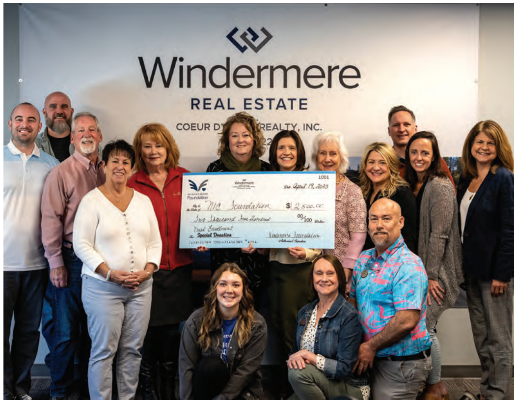
Representatives from Windermere/Coeur d'Alene Realty present a check to the NIC Foundation. Since 2006, the Windermere Foundation has provided scholarship funding for dual credit high school students as well as former dual credit students who continue their education at NIC after high school.

For more information on how you can leave your legacy, please contact the NIC Foundation at (208) 769-5978. Explore our free planning resources at nic.planmylegacy.org .