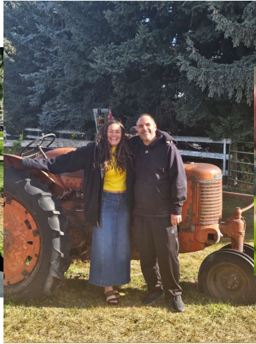
Visit to the Pumpkin Patch