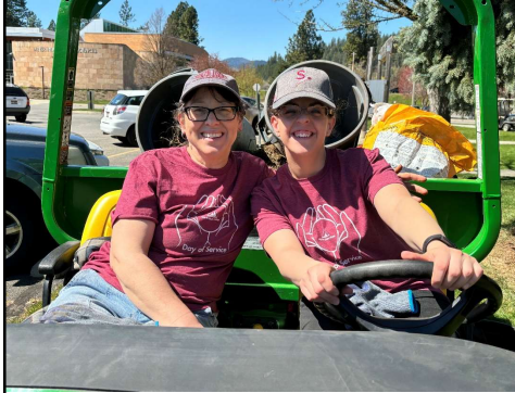
2024 Day of Service

Being in TRIO is like joining a family – students find a supportive community with a common goal: completing a college degree!