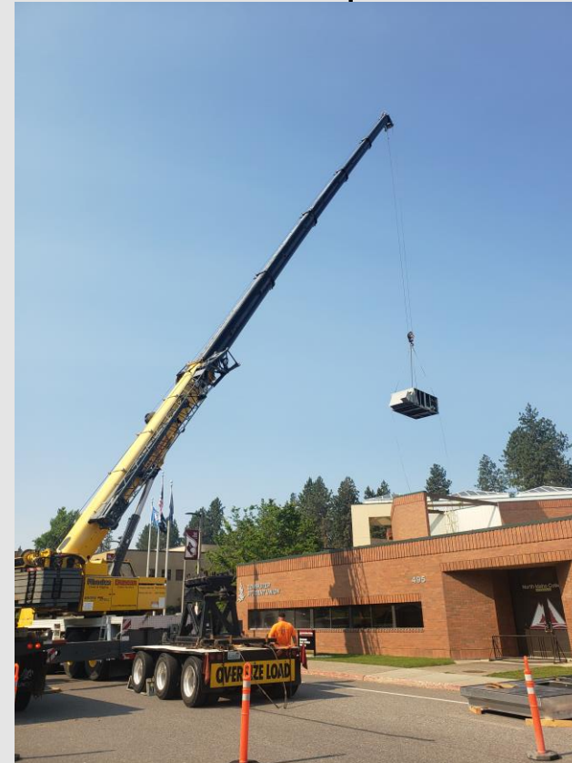
SUB RTU Replacement