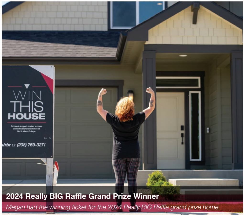
2024 Really BIG Raffle Grand Prize Winner

Visit nic.edu/rbr or call (208) 769-3271 for more information.